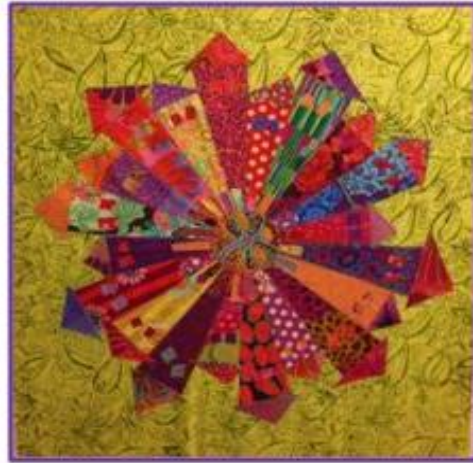
Wonky Dresden Houses