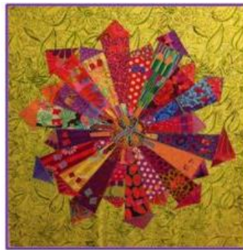
Wonky Dresden Houses